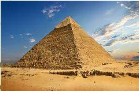
Revelation Lesson 15